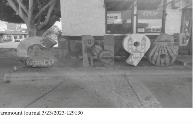
Paramount Journal 3/23/2023-129130

CITY OF PARAMOUNT 16400 COLORADO AVENUE PARAMOUNT, CALIFORNIA (562) 220-2036 planning@paramountcity.com