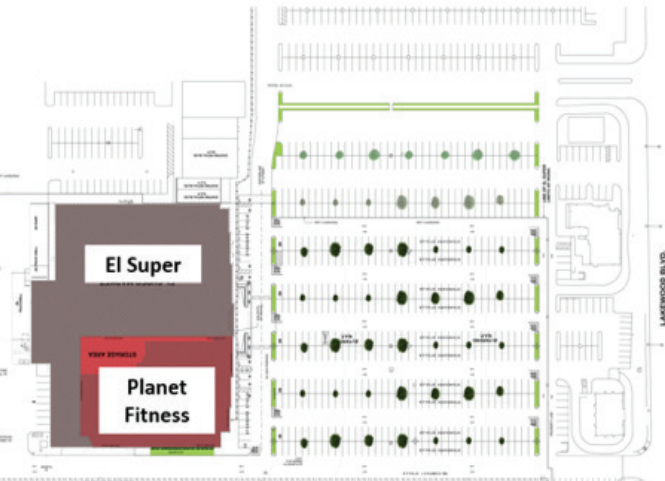
Paramount Journal 2/16/2023-127863